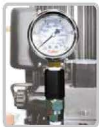
● Pressure Gauge